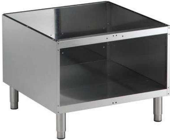
391154 (E9BANH0000) Open base, 1 module